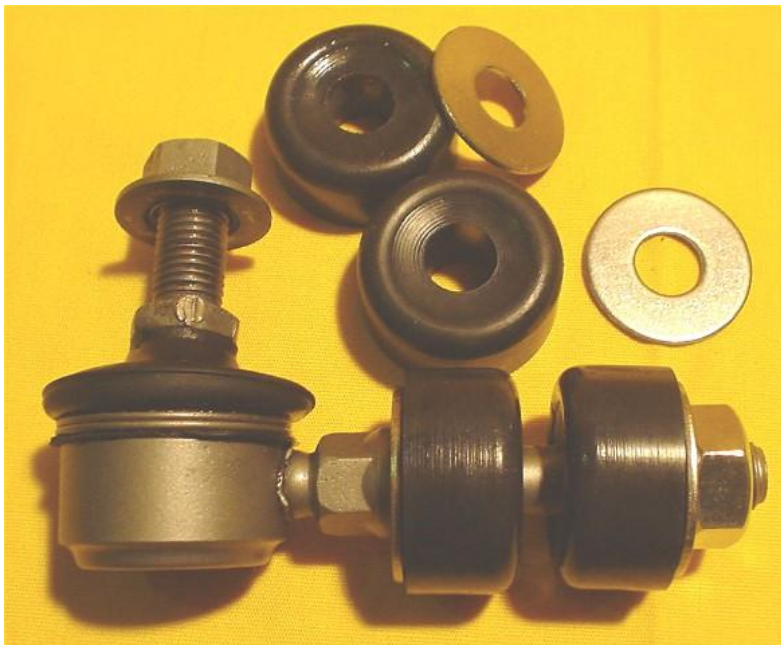
Rear sway bar end link